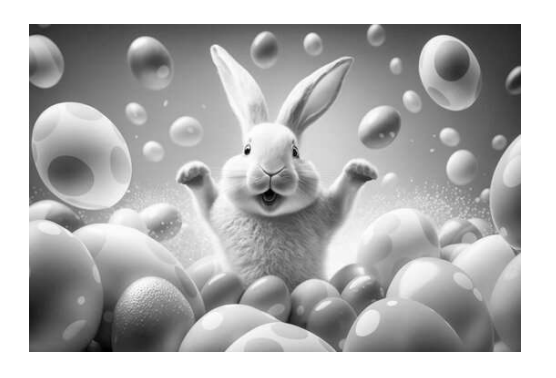
Makes for a GREAT Easter present!