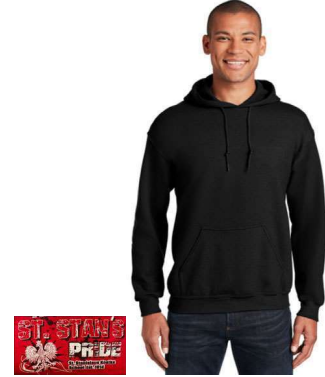
Hoodie Part Screen Print