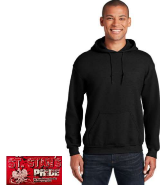
Hoodie Part Screen Print