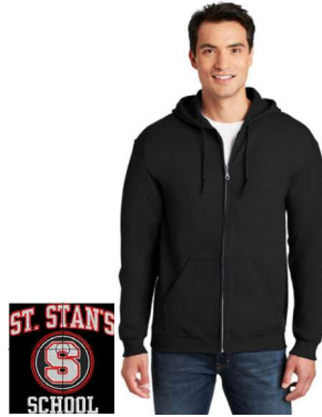
Zip-up Hoodie Embroidered